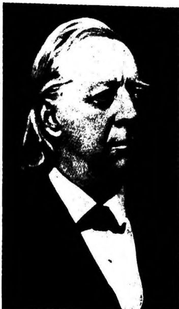
HENRY WARD BEECHER (1813-87), American Clergyman, was born at Litchfield, Conn. In 1847, he accepted a call to the pastorate of Plymouth Congregational Church, Brooklyn, N. Y. It was here that he gathered around him the largest congregation in the United States.

and inter-penetrated by spirit. Just as each drop of water, containing its own individual microscopic universe, is only a part of an ocean composed of similar drops, each with its own individual life types--so the earth upon which human beings live is contained by, and exists in, an ocean of spirit--together with similar worlds similarly contained.