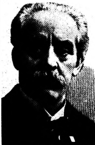
A forceful speaker during his lifetime, he was always urging the younger Spiritualists to attend The Morris Pratt Institute, Whitewater, Wisconsin. He knew that education about the laws of Psychic Science was one of the medium's prime requisites.

The Beckoning Light Spiritualist Church, Fifteenth Ave. and First St., Northwest, Miami, Fla.,