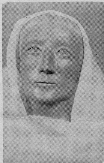
"Ready To Atone"