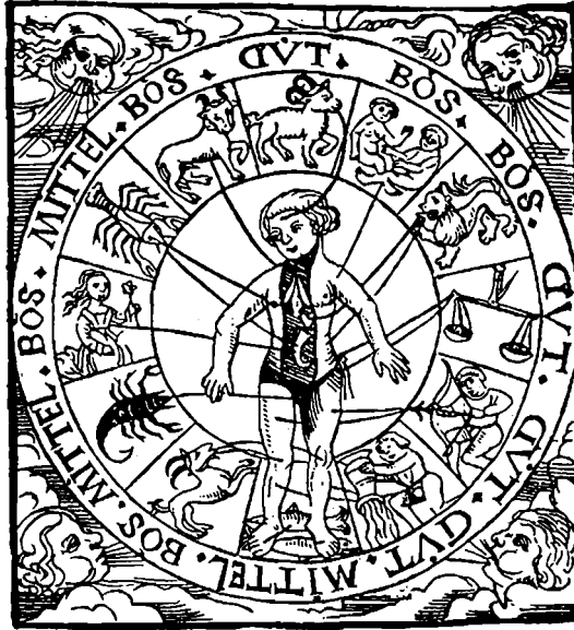
Early woodcut showing the relationship between the signs of the zodiac and the parts of the human body.

should be met on a devotional level, and the emotional block released through veneration and sympathy. Recreation with some outdoor activity will help. These folks live alone successfully if they have strong creative self-expression.