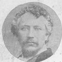
George Francis Train