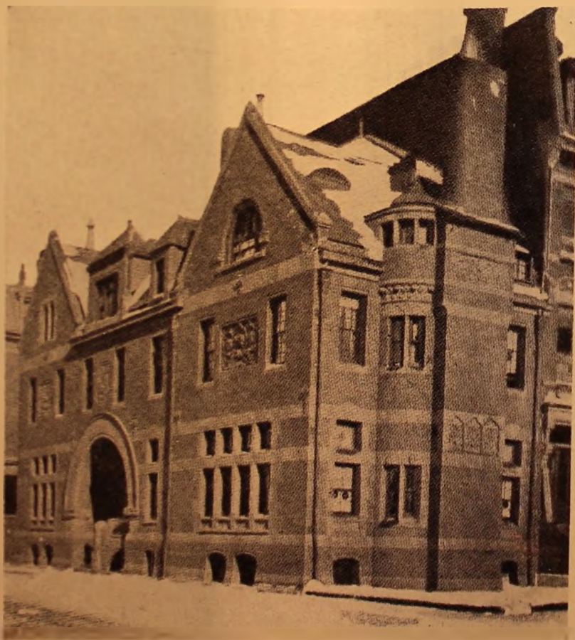
Parsonage and home of Bishop Phillips Brooks, Copley Square, Boston. Mass.