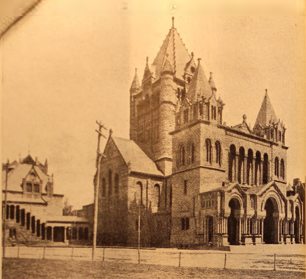
Church of Bishop Phillips Brooks. Copley Square, Boston, Mass.