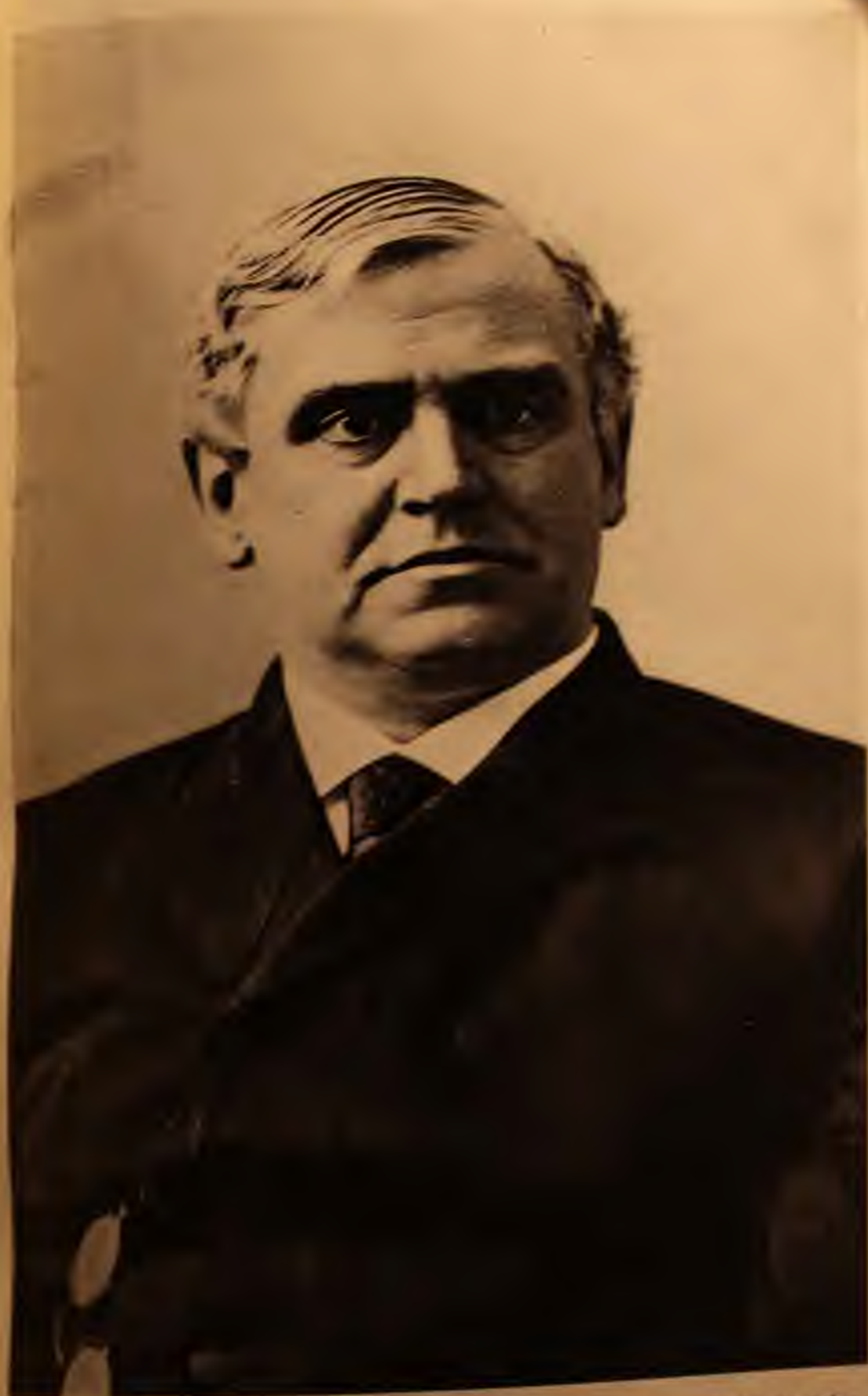
TELON Bishop Phillips Brooks, 1835-93, of Boston, Mass., Disciple of John the Revelator and heavenly medium for the Holy Theomonistic Bible.