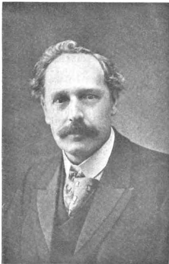
ARTHUR EDWARD WAITE.

term—this has been Mr. Waite's life task. Personally, I would describe him as a Sacramentalist rather than a Catholic. Tolerant, possibly even in excess, of all forms of opinion, his attitude is yet, in its endorsement of the Church's authority, one which is, of necessity, condemnatory of every form of heresy. Protestantism he describes as "Not so much a dereliction of doctrine