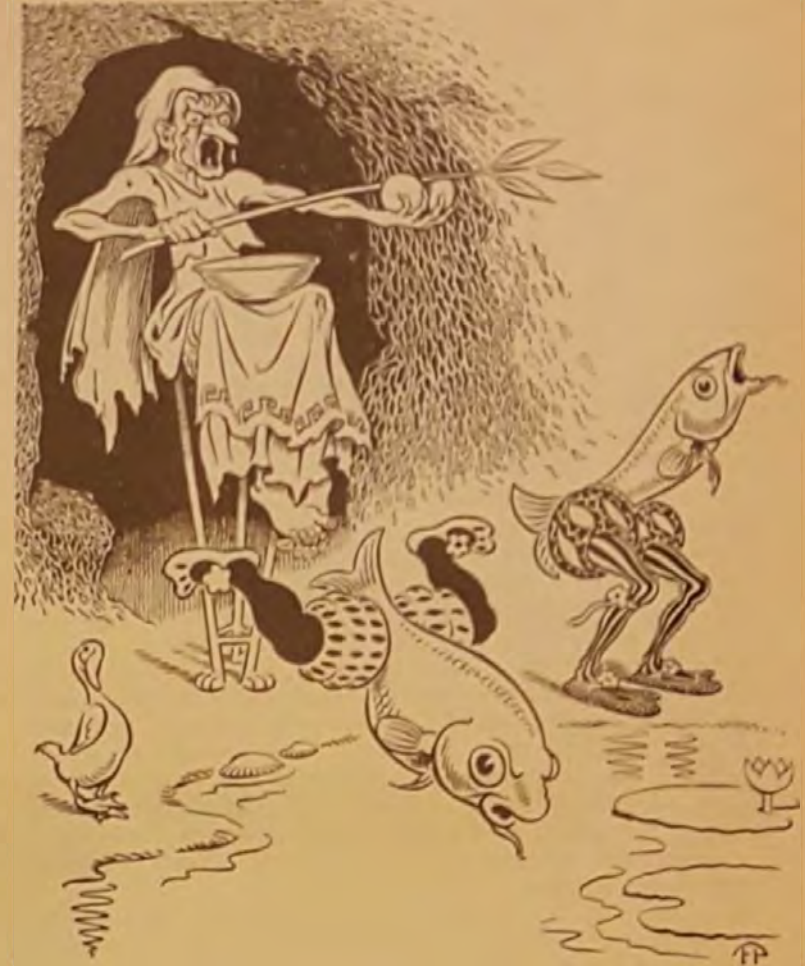
AS Venus had feared, when it came to the moment of declaration, she had risen no higher than a vaticinatrix. Thus found herself as Eve holding two apples and a sprig of myrtle to charm all into active reproduction. (See text in col. 1).

Rabelais, as much as he was striving to get away from old ideas, was still using old terms, thereby only just changing the colour of the garment. It must ever be a struggle to master old ideas, and bring completely new ideas into birth.