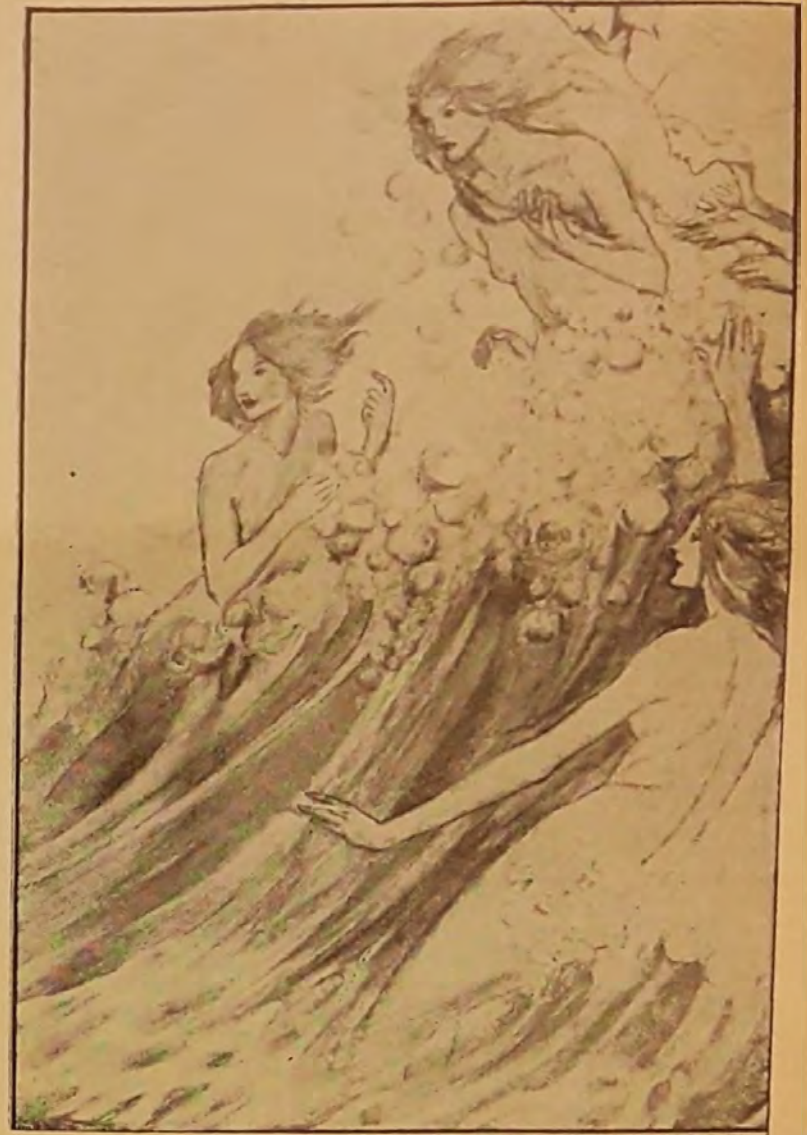
NYMPHS OF THE FOAM

Dice is closely associated with the Furies, and makes sure that no offences go unpunished. Thus by this, whatever place or clime, the foundation of