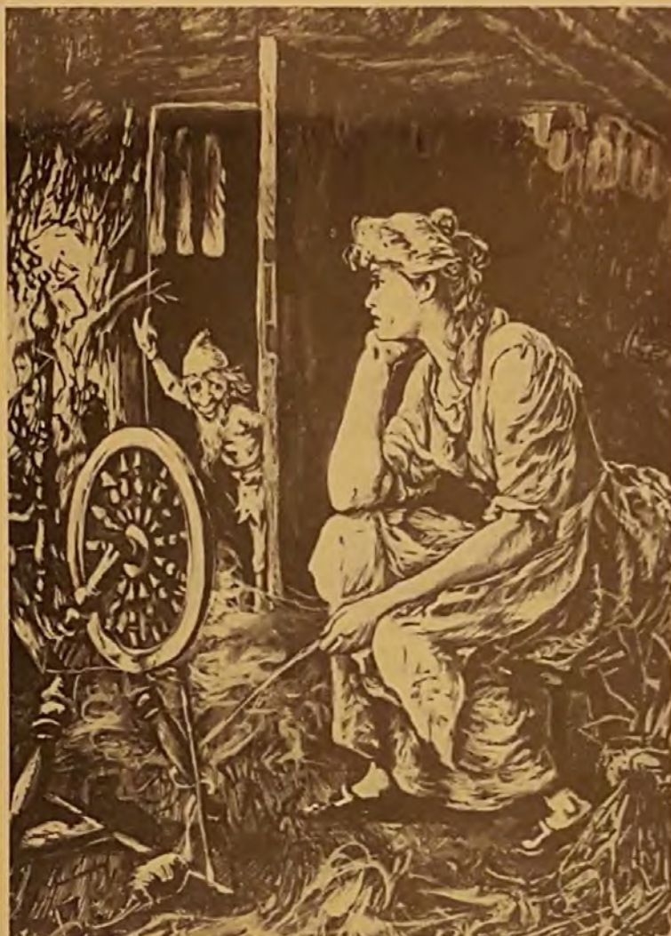
VENUS SEEKING LIGHT

But only those who have been kissed by their descending beauty can understand the full meaning of Exodus c. 16 v. 13, 31. "And they called it Manna, and it was like unto the coriander seed; white, the taste like wafers made with honey." While in verses 33-5 "Moses told Aaron to take a pot and put an omer full of manna and