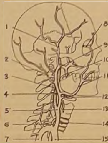
Main Arteries of Head and Neck