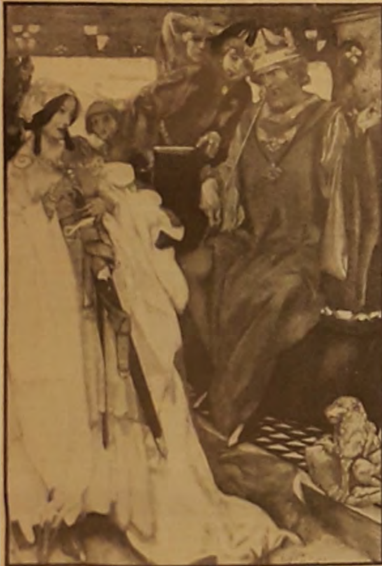
VENUS - URANIA

D IVINE HOLY GLORIFIED Beauty of the Divine Unfoldment of Earth and Heaven, we seek now of Thy Holy Unction, that we can be led—both Heights and depths—into the Glory of Thy Wondrous Light. That as we enter into the Great Etheric of Thy profundity, we can be the means of uniting even those depths with the Heights, and sending forth those Heights into the depths. So, Great One, Thou of all Beauty, embrace us, and Spurn us with Thy Stimulus, that we can perform Thy Will in all its Reality. Amen.