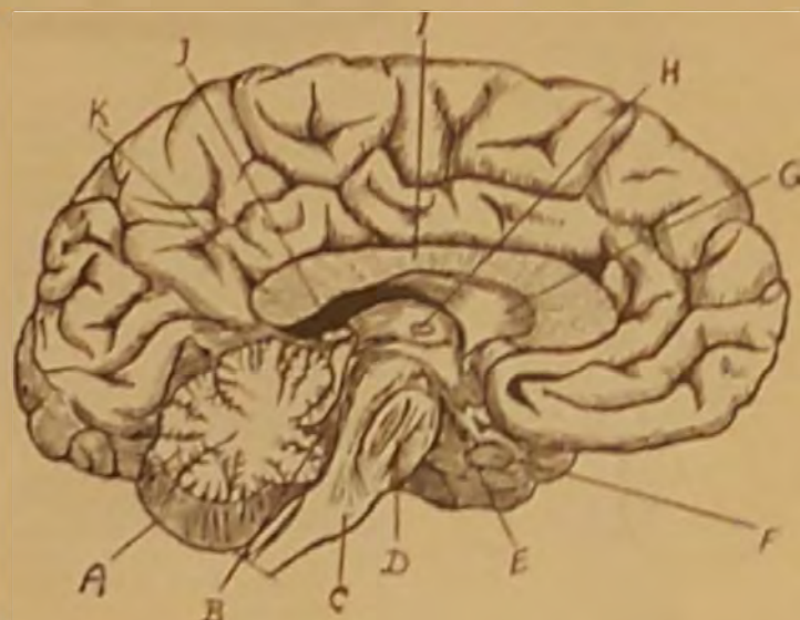
A. Cerebellum. B. 4th Ventricle. C. Medulla Oblongata. D. Pons Varolii. E. Albicans Cinereum. F. Pituitary. G. Septum. H. Middle Commissure (3rd Ventricle). I. Corpus Callosum. J. Pineal. K. Quadrigemina. (See text in cols. 1 and 2)

Once you are able to bring this into birth, you too can speak with the Voice of Divinity, speak Truth and Wisdom which you have never spoken before.