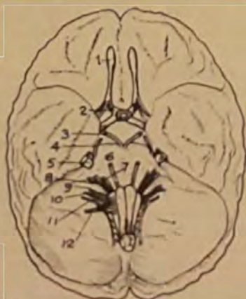
12 Cranial Nerves

Yet the chemicals being put into tinned food is deplorable, and will ere long be showing its outcome, especially the