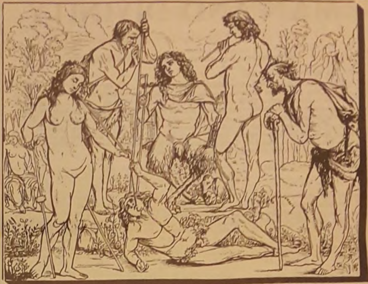
THE HERMAPHRODITE PAST

THE great mystery of man after he fell from his god-like status, into the lunar waters of sensuality. Instead of rising up onto the Vega Mind Plane of Divine Sensitivity. Now the Hierarchical-driven Hydrogen Fires will force him back up to that elevated Plane of Royal Divine Consciousness, whereby the bestial states of the earth will disappear, and all souls take on of their polarised holy electrified etheric counterpart. (See text in cols. 4 and 5).