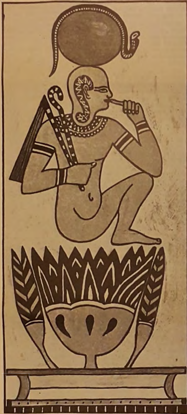
THE CHILD OF LIGHT

(So it is the very powers of the Cancer creation, the very depths of Cancer that lie in the waters, that can lead the soul out from the very depths to the heights. She is the very root, the old mother-creation, and she can be the means of leading you out, once you are able to recognise that there, in the fluidic waters, she has the very algae of time.