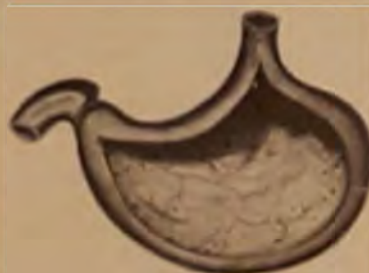
Inflamed Stomach of Cigarette Smoker

When you think of how man has been created, it leaves the truly comprehending mind a little aghast. Every organ being created in the soul's descent into the depths, which at the present has its connections in