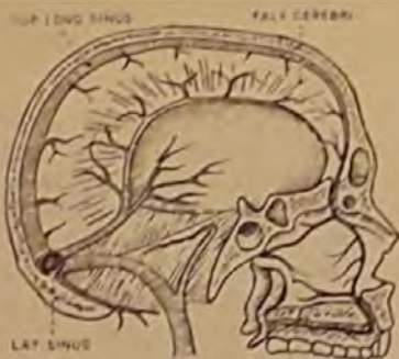
Venous Sinuses within the Cranium