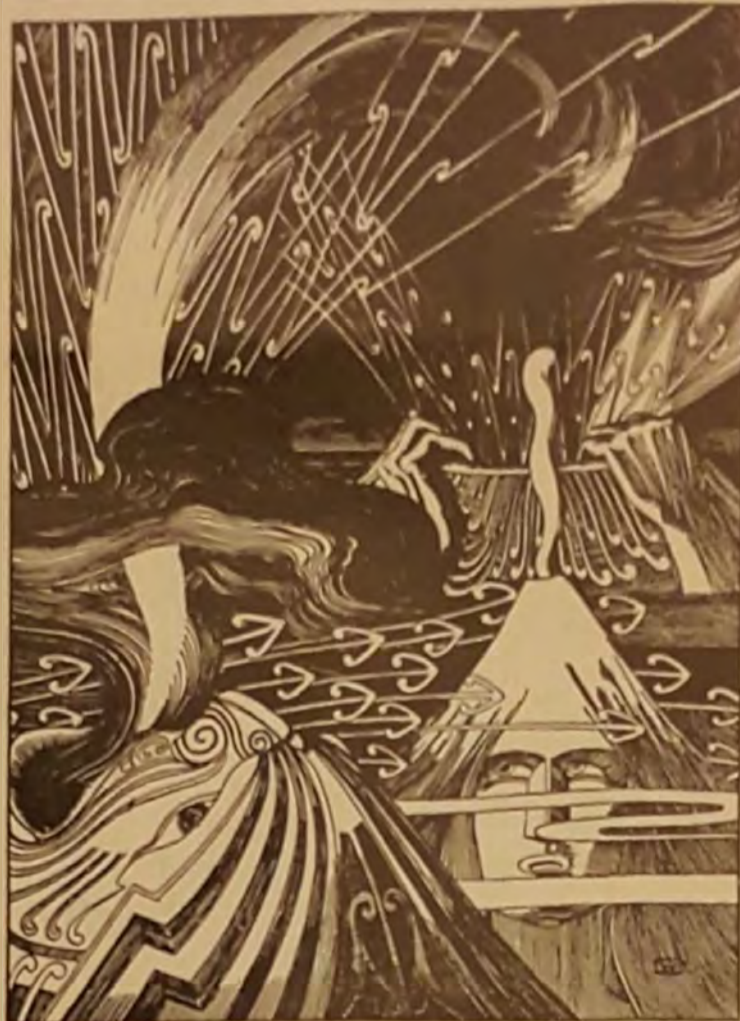
THE VIRGIN FOUNT

(So the whole World is now hovering on the cusp of Holy Divine rebirth. All it needs is the conscious mind to be given new thought, to drop its Saturn state and transmute its Saturn into Solar Glory. Then the soul will find itself born of Divine Holy rebirth).