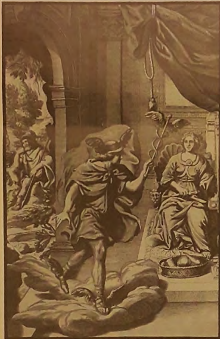
THE BIRTH OF THE MIND

While the Scapegoat who took on of the suffering of the World, gains complete redemption and ascension back to the Heights they created by their Divine Belief. Therefore, every man must create and give before he can ascend back HOME. This is the story of the Prodigal's return.