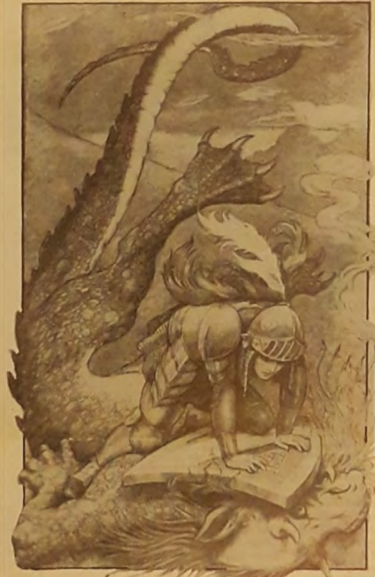
MASTERY OF THE DEPTHS

brought to LIGHT by the ever eternal feeding of Divine Outer Space, the Royal Glory of Divinity. Therefore Atom to