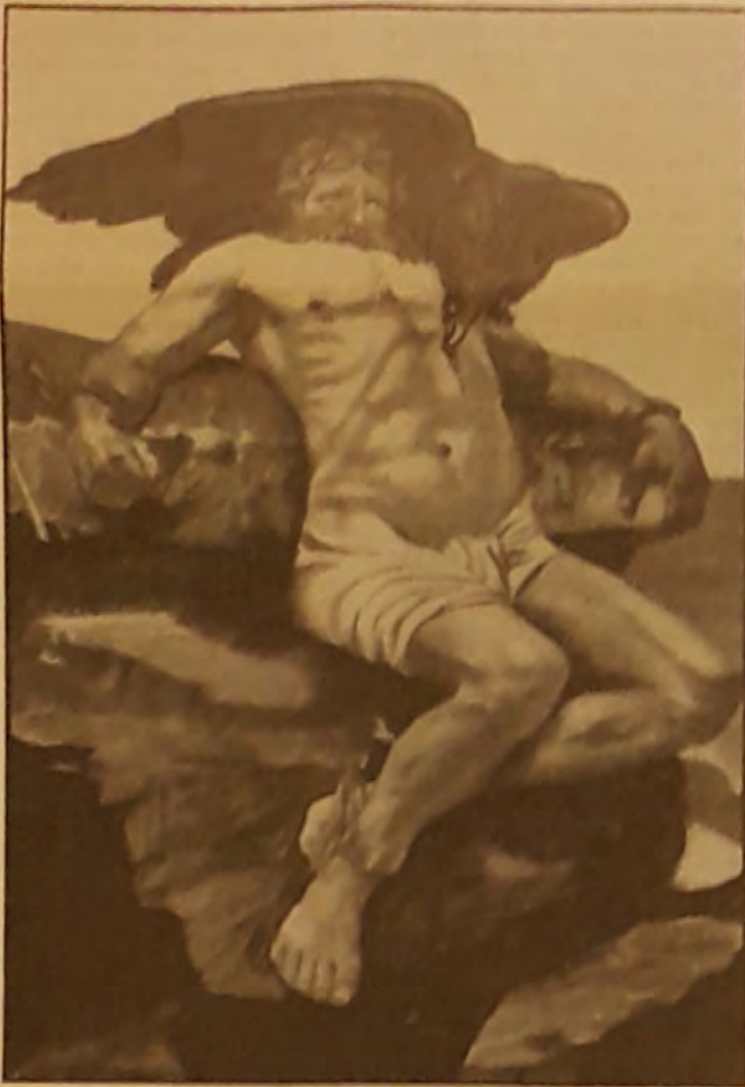
CHAINS OF NON-EXPANSION

This naturally indicates an action of another presence that is continually moving, whether forward, round or up, but never backwards. This is the