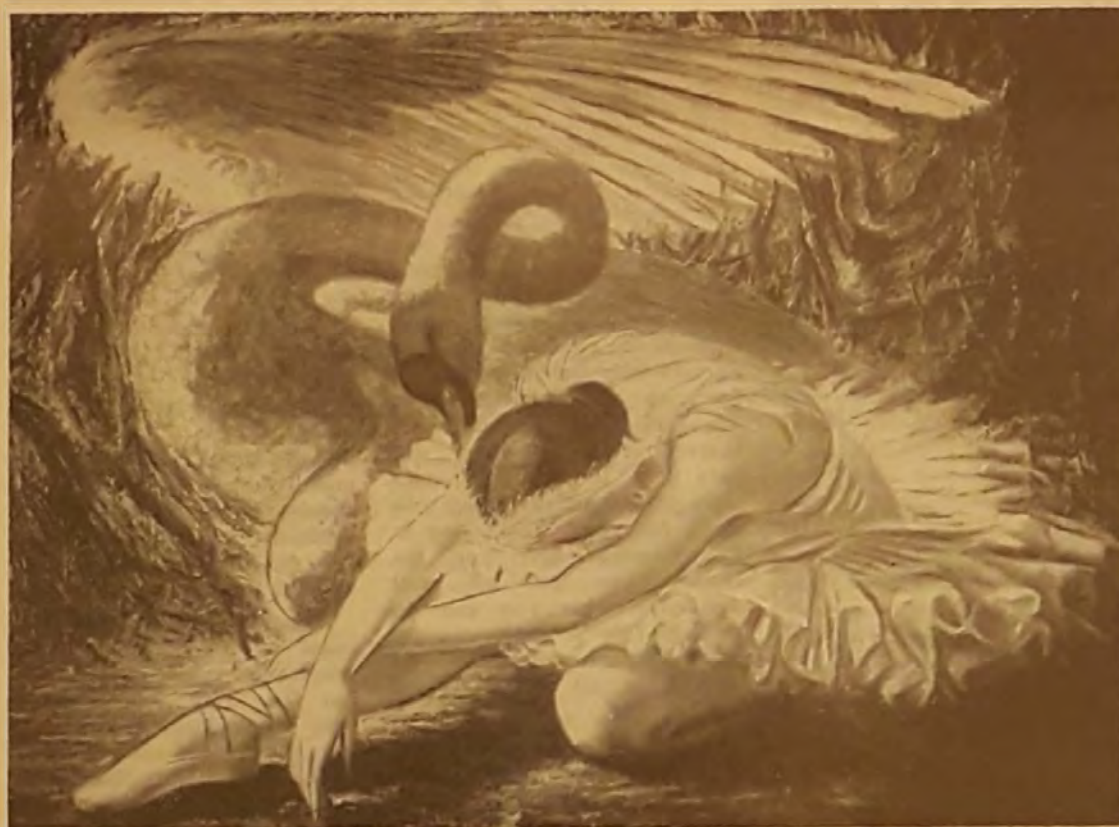
THE DYING SPIRIT

Man has much to learn, much to grieve over and for which to ask forgiveness, for when he can realise the great depth of the creative force of nature, then he will realise what lies at his own door, not only to raise himself up onto greater heights, but also those creations that lie beneath him; they are his responsibility as well.