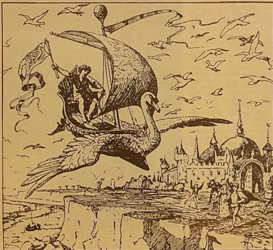
THE WORLD OF NEPTUNE

HERE in a world of formless glory, the mind can wing where'er it wishes. In and out, up and down, nothing is barred to the soul who is seeking of mind unfoldment, in the mystical Realms of Neptunian Splendour. (See text on page 5, col. 5).