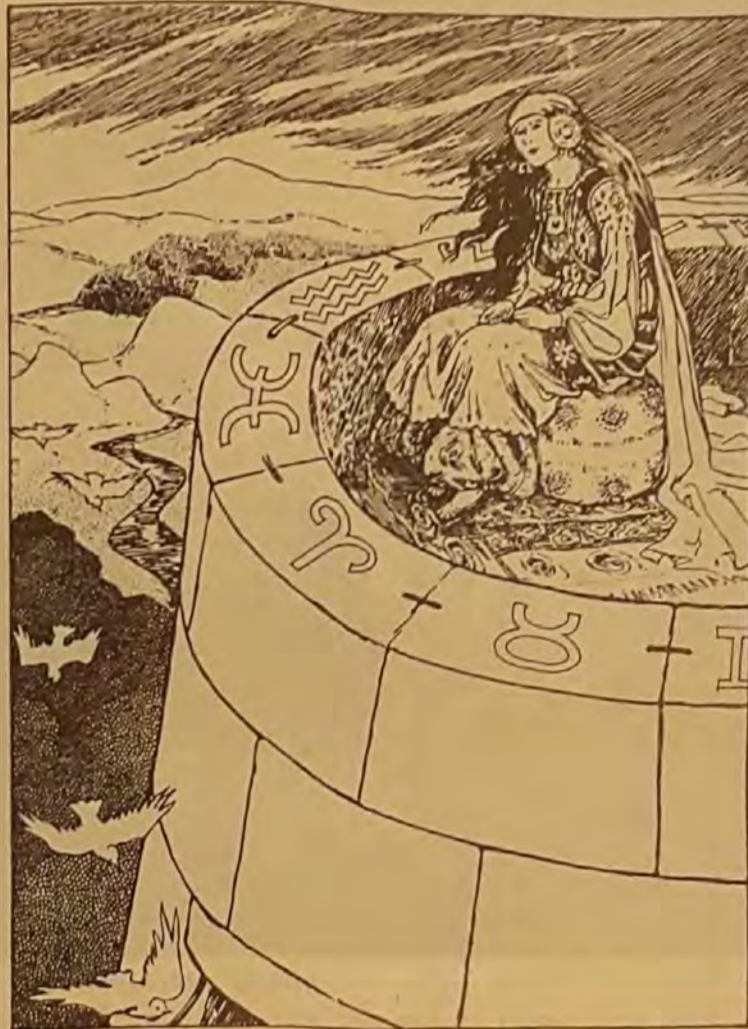
THE CASTLE OF THE MIND

While the esteem of the once Central Sun of Shamash, has now been infused with the Sun in Scorpio reality, and is the constant flow of Uranian pulsation born out of the Virgin Heart extraction. The soul now, through the Virgin exaltation, drawing from this Mighty Source. Yet in reality, the original source now risen