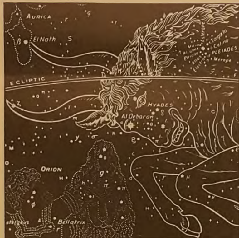
THE ROYAL BULL

THIS is the great prerogative of man, to live as a Solar Galactical Priest, unfolding the Royal Glories of the Fatherhood, through the medium of the Breath. Once he can open up his heart to the Heavens, the whole of the Universe lies before him, waiting to deliver up its ageless secrets, as dynamic glories, as yet undreamt of in the mind of man. (See text in col. 1).