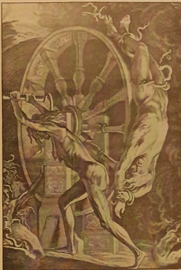
THE WHEEL OF REBIRTH

Nothing is by chance, it is all a matter of molecular mas-