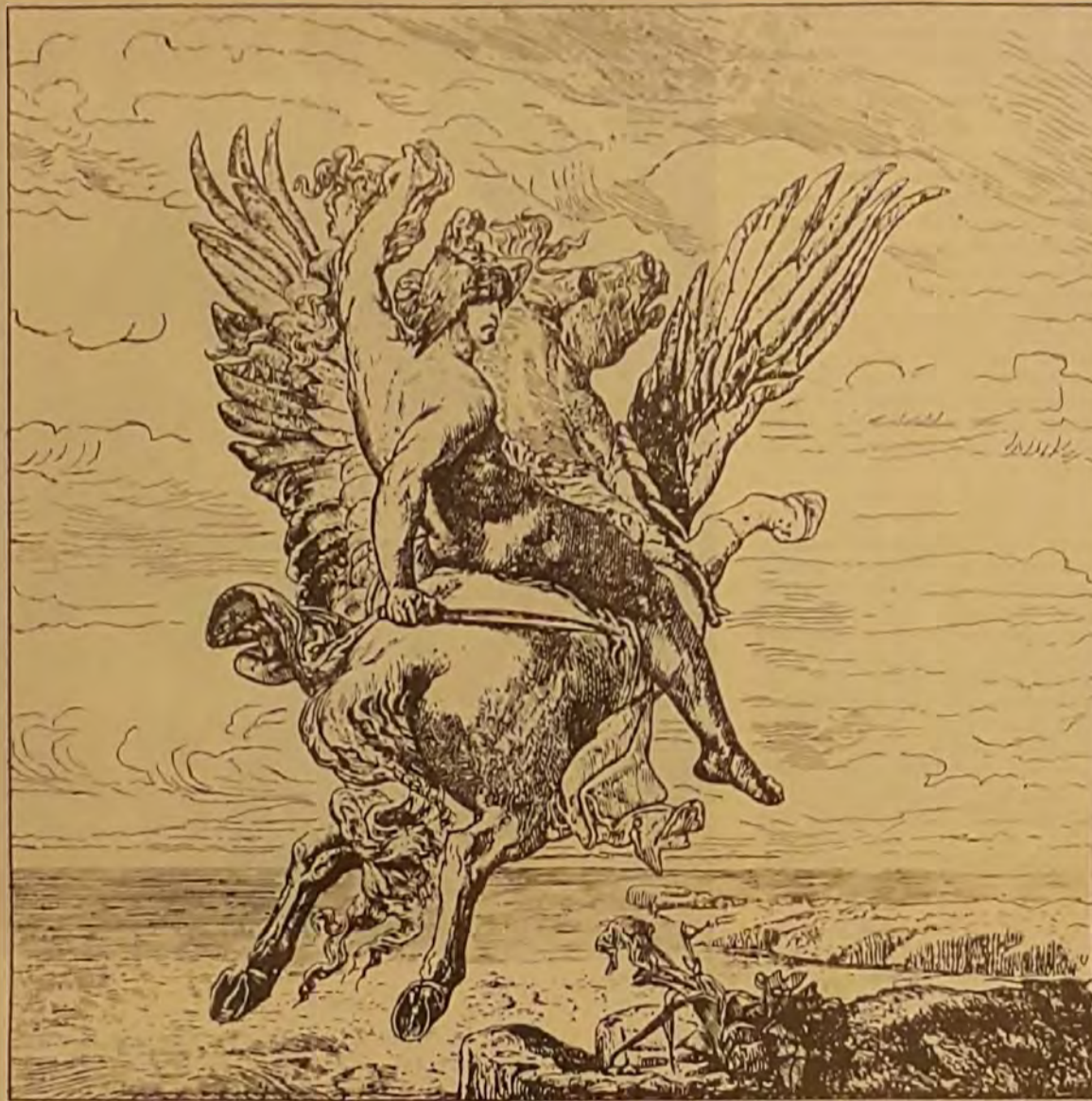
THE WINGED MIND

This world, that is of an earth context, is going to become of an Immortal Creation, and those who are willing to change will become a part of it. For the moment you might say "I cannot imagine that," but changes have been taking place for the past seven years, rapid changes, although you may not have seen them; yet they have been literally changing under your feet, and you have changed with them. You have become born anew with them, and now the New World is about to begin, and it is a Solar World, and that is why the Solar Creation is beaming down upon the Earth as it is doing, and that is only the beginning. The whole world is going to become of Solar Light, and you are going to be a Being with it.