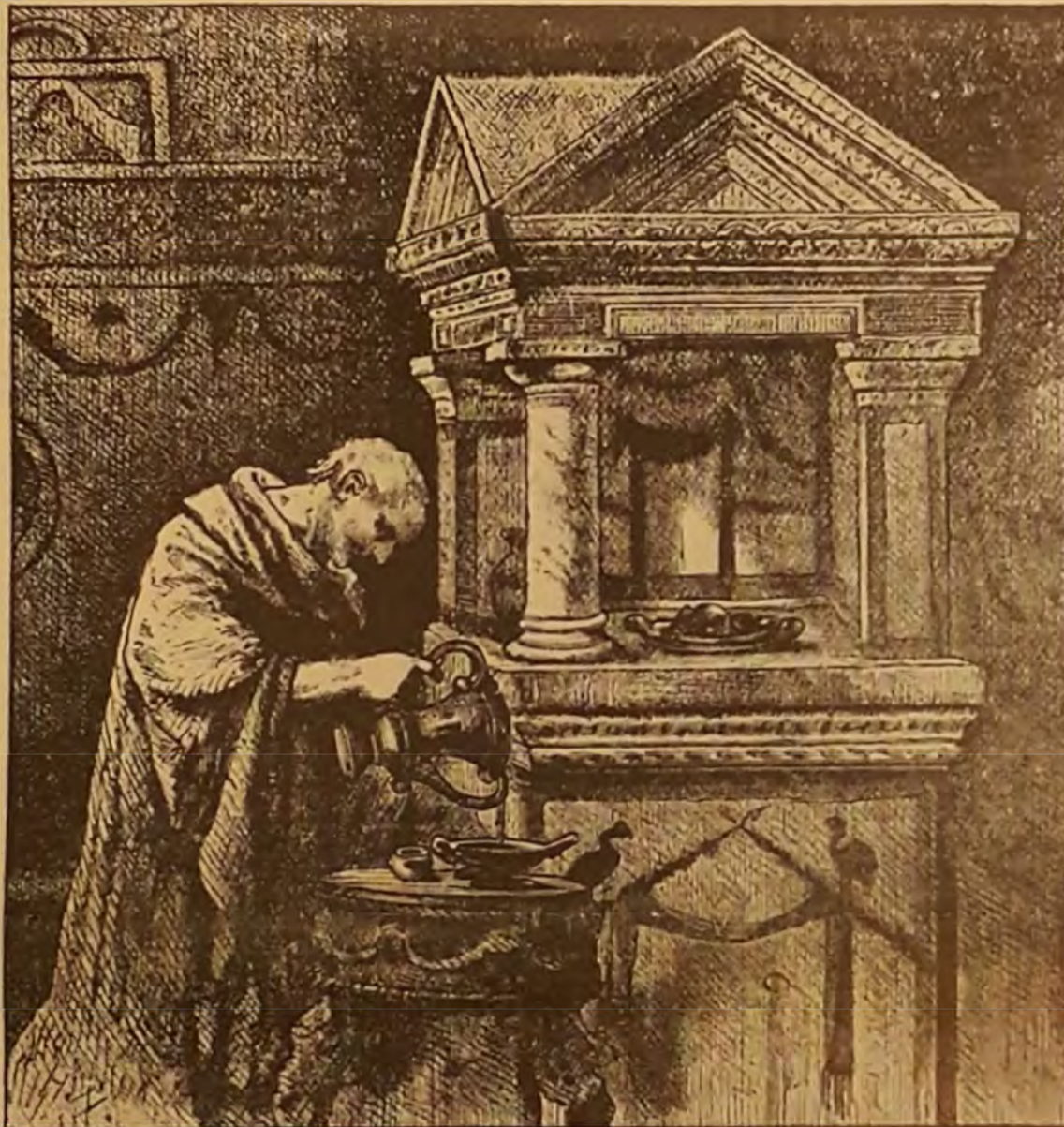
THE GODS OF THE HEARTH

Thus it can be understood that Hestia was the goddess of domestic life and the giver of