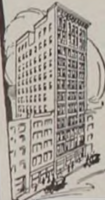
Federal Bldg., Chicago, Ill.

The Federal Life Insurance Co. of Chicago, one of the leading Insurance Companies of America, is back of this policy. With 25 years successful operation—assets in excess of $7,500,000, this company has paid more than $10,000,000 to its policy holders and beneficiaries since its organization.