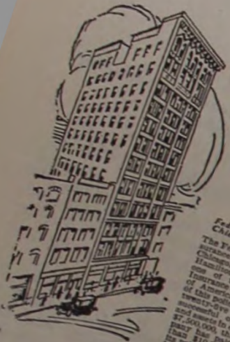
Federal Building, Chicago, Illinois. The Federal Life Insurance Company of America, Inc., is one of the leading insurance companies of this policy. It has a successful record of 27,000,000 in assets and has paid more than $10,000,000 to beneficiaries since its organization.

for all members of the family--between the ages of 10 and 70 years