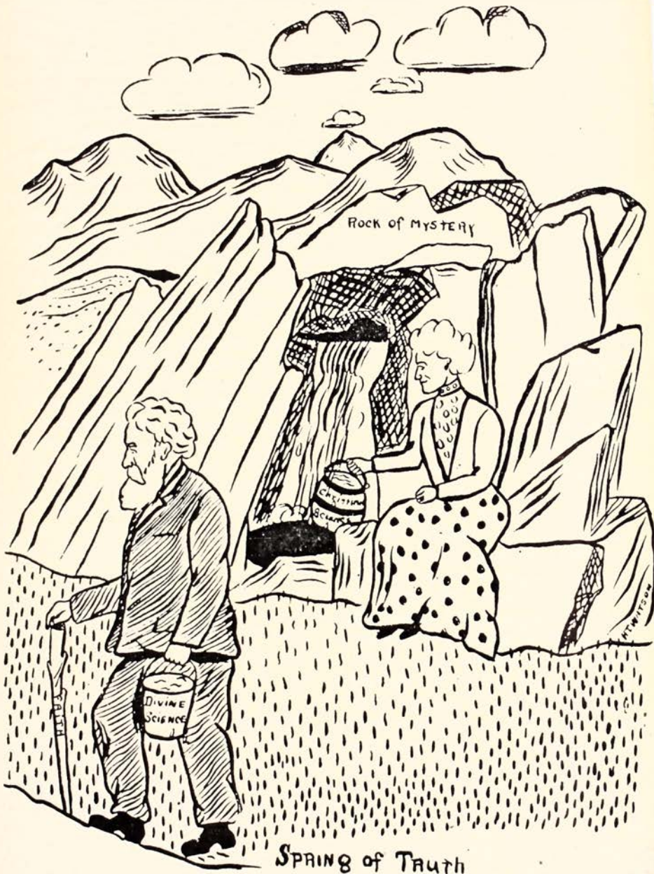
SPRING of TRUTH