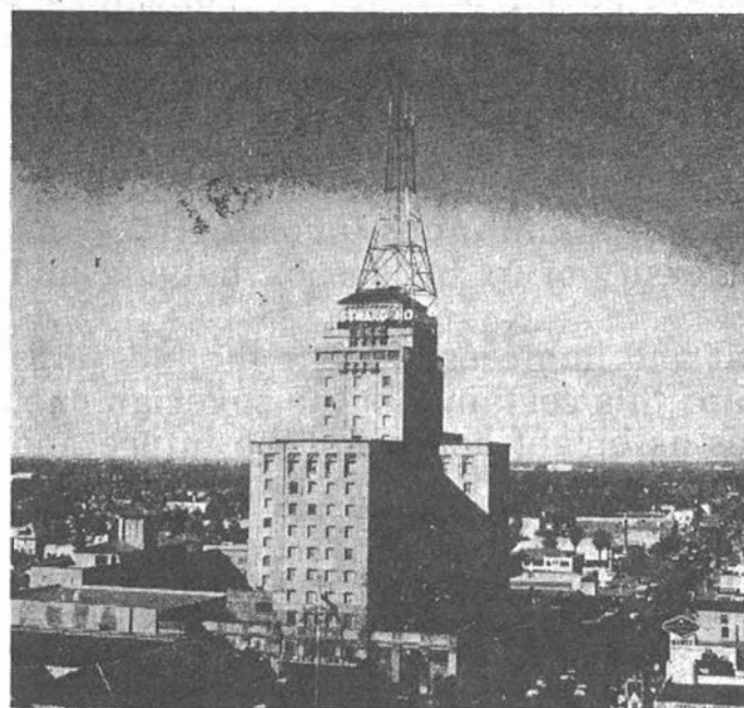
Westward Ho Hotel

Tour: October 7 Selected tour to be announced.