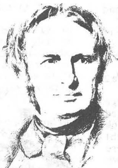
Henry Wadsworth Longfellow