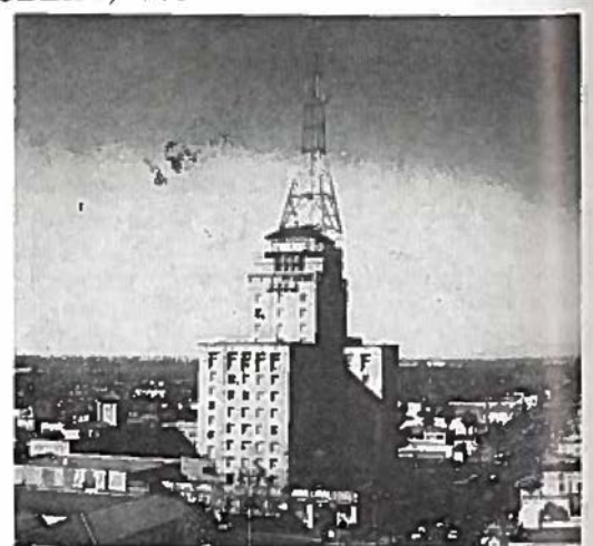
Westward Ho Hotel

Sunday October 3 at 2:30 P.M. Hospitality Hour. Tour: October 7 Selected tour to be announced.