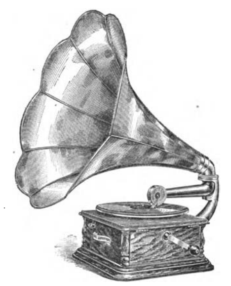
This Style $30.00 Other Styles $45.00, $75.00