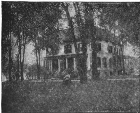
When replying to advertisements please mention THE NAUTILUS.

I make personal letters a specialty. Will write one letter to suit the particular need of each individual and give one month's treatment for 25 cents, or write three letters and give three months' treatment for 50 cents. In writing state age, occupation and explain your case fully. Prefer no stamps. LAURA B. MAHON, Clarkston, Wash.