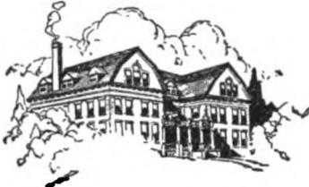
THE HOME OF NAUTILUS