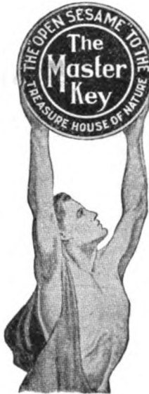
Reg. U. S. Pat. Off.

is probably the most popular booklet ever written; more than a million copies have been printed during the last ten years. It contains the essential truth underlying every system of philosophy, and tells how every undesirable condition may be modified, changed or adjusted.