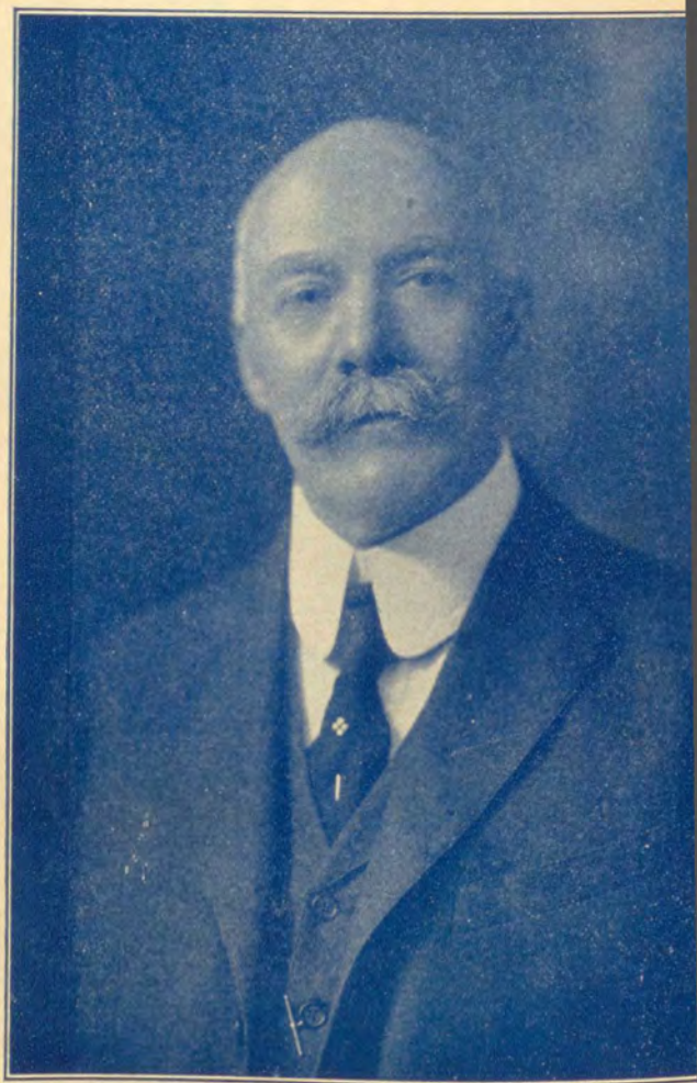
Orison S. Marden