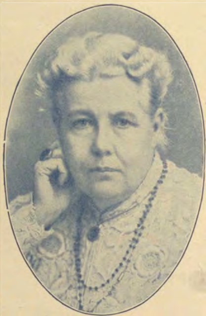
Mrs. Annie Besant