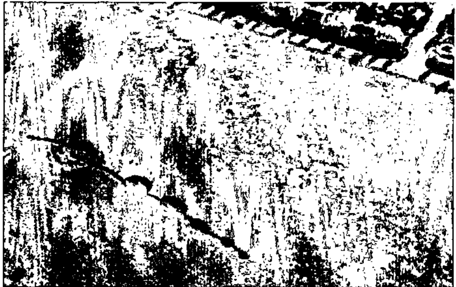
The Vacaville, CA, crop circle in corn.

to crop circle researchers in the United States and Canada who we knew had experience in investigating corn crop circle formations, and who we had been in contact with about the Vacaville formation already, to join us for the world's first International Tele/Video Investigation (TVI) of a crop circle formation.