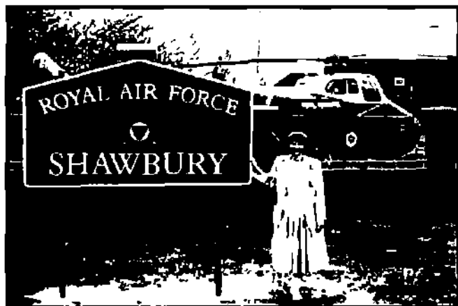
Jenny Randles takes a break in Shropshire, England, following a lecture to RAF officers.

years, crop circle research has not been idle during that time. It has established conclusively that outside the pretty widespread hoaxing that clearly is rife, a smaller scale, but real, if usually more simplistic, phenomenon does genuinely exist.