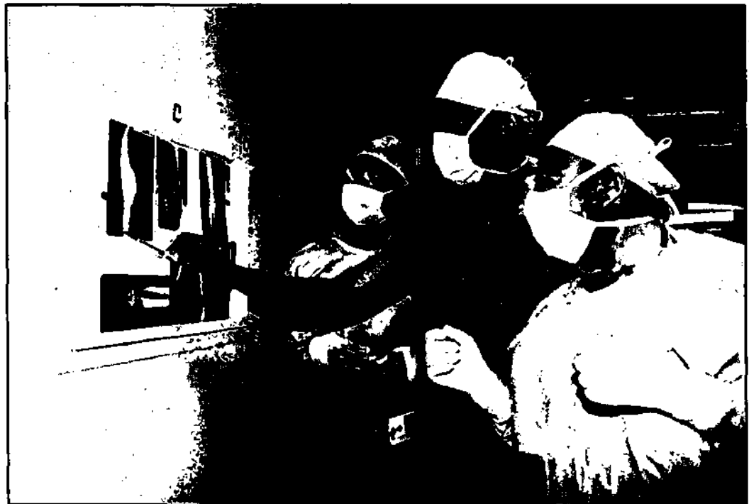
Surgeons review x-rays.

These are all covered with a very strange tough dark gray membrane that rejects opening with a surgical blade until the objects have been dried for 24 hours. Analysis of the membrane shows that it is composed of the body's own tissues and contains only three major factors: a pro-