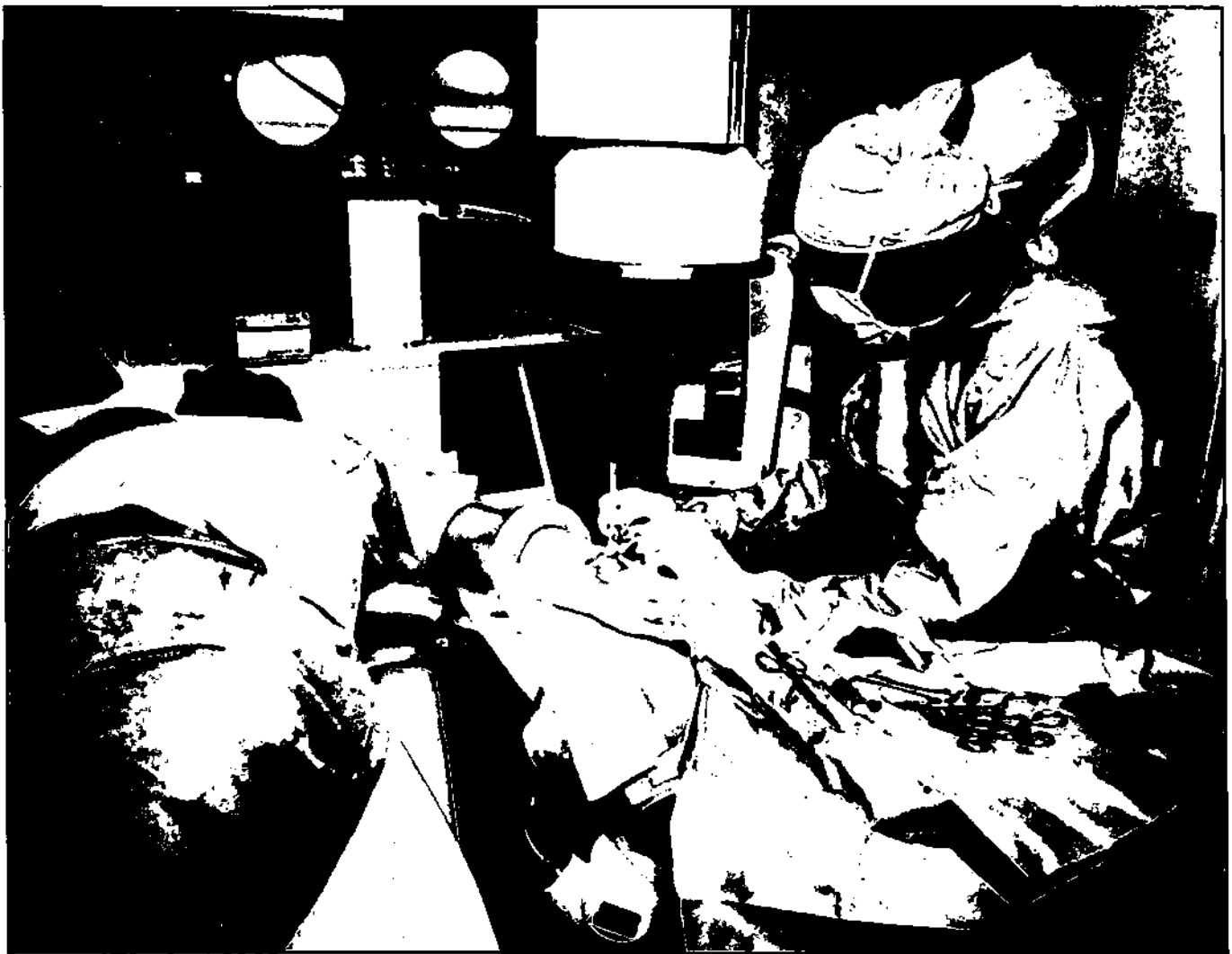
Surgeon Removes Implant.