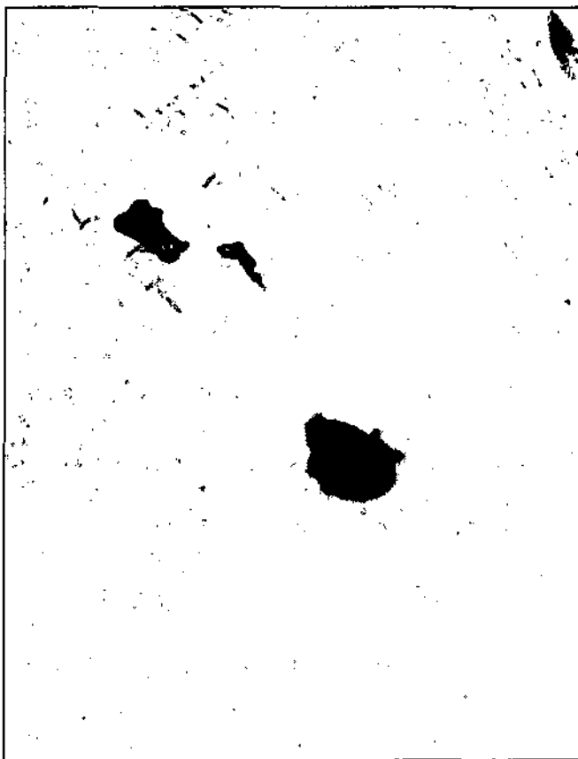
On a gauze pad is the object removed from patient's left thumb.

The Spanish Air Force has completed its declassification of 62 UFO files that had been collected over the past thirty years. The files have been deposited in the Air General Headquarters Library in Madrid and were until recently classified Secret.