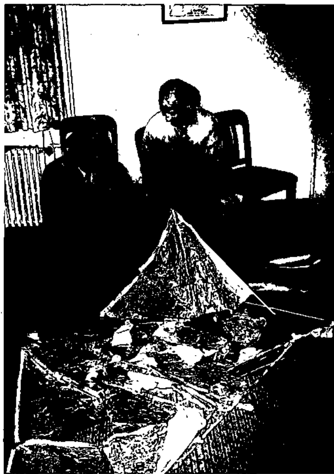
Brig. Gen. Roger Ramey, commanding general of the Eighth Army Air Force, kneeling, and his Chief of Staff, Col. Thomas Debose, with what is claimed to be debris from the Roswell crash.