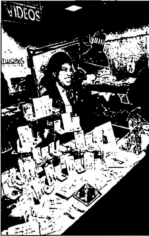
Inside the vendors' room.