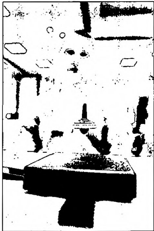
UFO top floats, but will it fly?