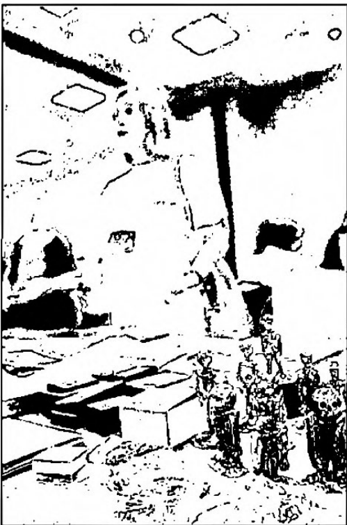
Gloria Wingfield at the crop circle table.