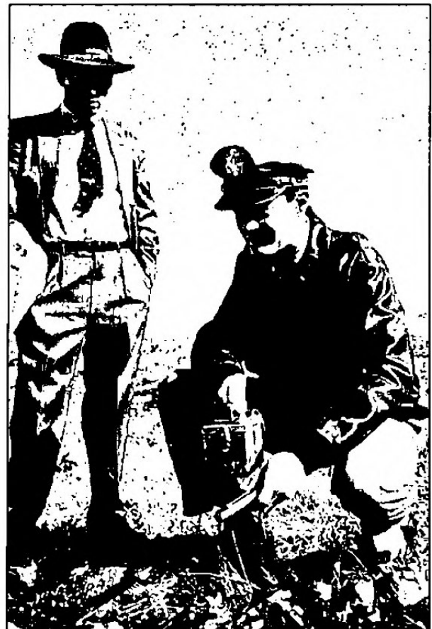
Left to right: Xander Berkeley as Sherman Carson and Kyle MacLachlan as Jesse Marcel.