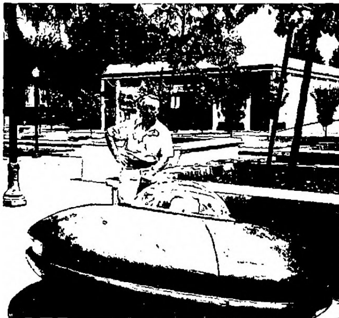
PAUL C. CERNY UFO Crash in Mountain View in Civic Center (California)

August 14 & 15 — International UFO Conference, "UFOs: Fact, Fraud or Fantasy." Sheffield Polytechnic, Main Building on Pond Street in Sheffield, So. Yorkshire, England. For information please contact Independent UFO Network, 1 Woodhall Drive, Batley, West Yorkshire, England WF17 7SW.