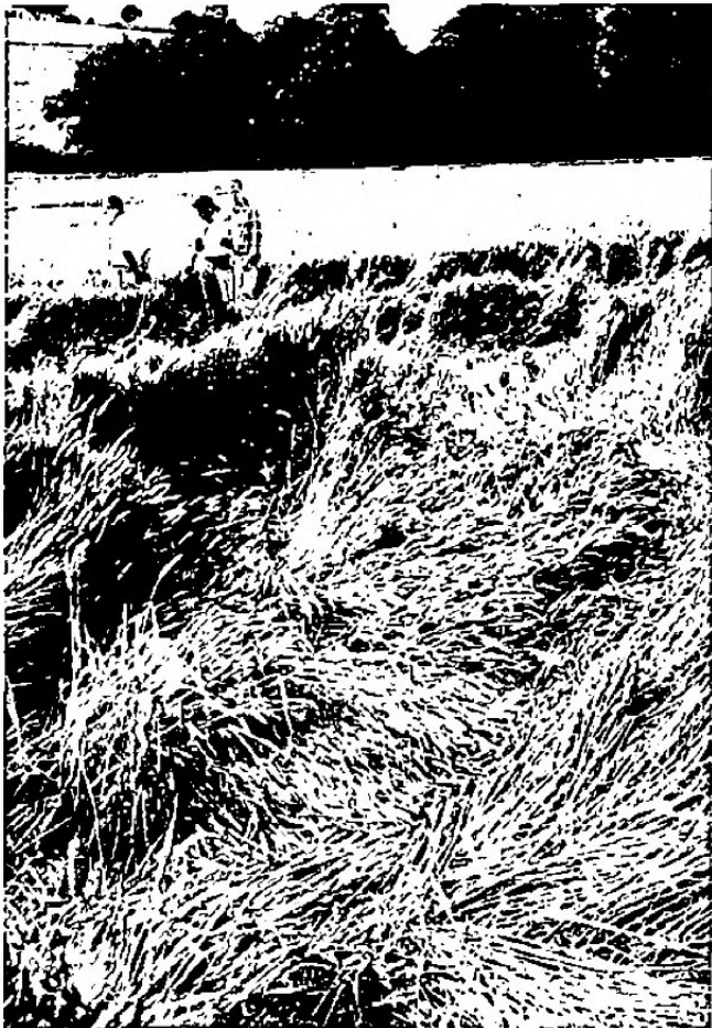
Ordinary lodging caused by wind and rain damage Note the highly irregular flow of the "floor plan"

The tramlines here pointed directly at the green ridge of east-west running hills which formed the far horizon. From their heights sailed a hang-glider or two, catching the late afternoon summer currents. Three people with tape-measures and a camera atop a tripod were already in the great central "shell" of the Snail, a flattened circle 122 feet across, laid down in a counterclockwise direction.