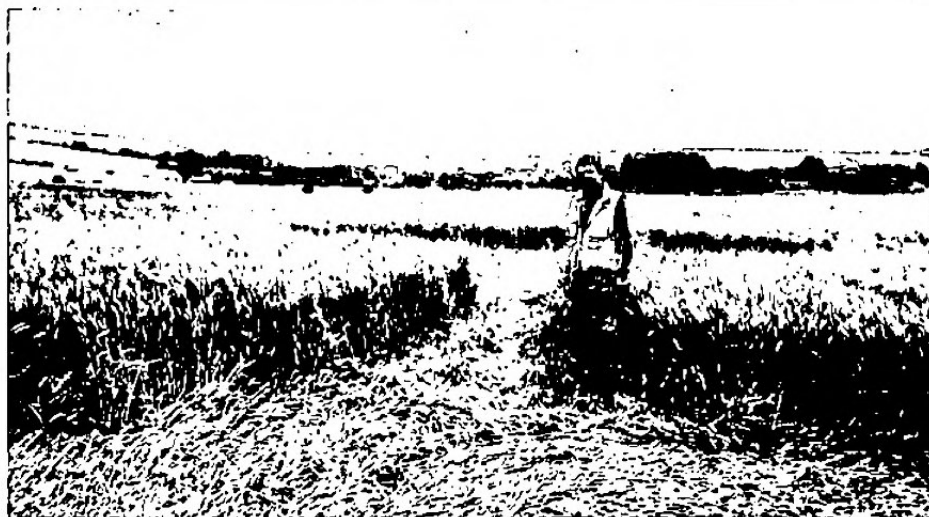
The author, in a relatively unvisited dumbbell formation with the village of Alton Barnes in the background.

hoaxes. Sage advice, but I'm not sure how well or easy it went down with the faithful.