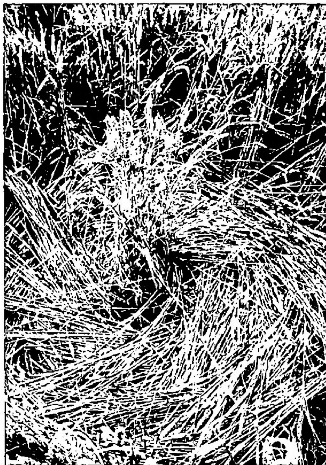
A small, undisturbed grapeshot circle with a standing "corn doll" in the center. Near Alton Barnes