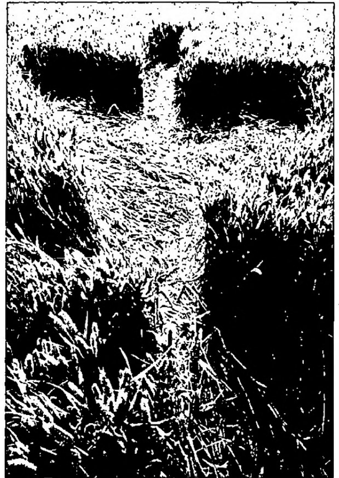
An arrowhead pointing to the Lockeridge formation Obviously added after the fact by human hands

M y expectations of being able to learn much from the ground at this late date were not high. Circle formations deteriorate rapidly once word of their location gets out and the public starts pouring in. The pleasant young girl at the dreadlock caravan told me that some 200 people had already visited the Snail. And what a mess they had made of it. I entered at the "head" of the thing, which consisted of another anticlockwise circle 44 feet in diameter, from which protruded two "antennae." From here a more or less straight path ran into the lower curve of the larger "shell" circle and continued onwards another 50 feet or so before culminating in yet another counterclockwise circle, or "tail," 41 feet in diameter. The long pathway itself was over ten feet wide, the wheat stalks flattened toward me as I approached the central circle, and away thereafter. A short distance away were two