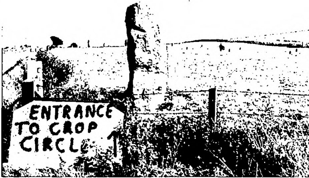
This particular circle, located in the field to the right, just happened to be "conveniently" visible from the well trafficked Red Lion pub in Avebury

permission to enter their fields and collect samples. He gave her the coordinates of the field we thought Busty's new formation was in and we piled into a car to see what, if anything, was visible from the road.