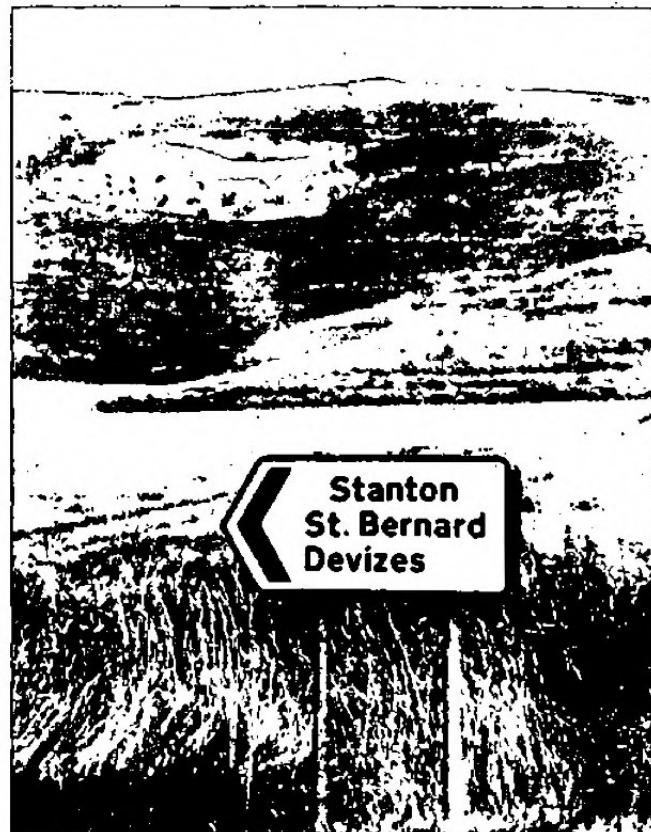
The heart of crop circle country