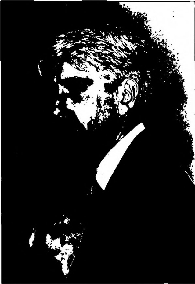
Jacques Vallee's Forbidden Science: The UFO Phenomenon and the Research Community

Some cinema buff out there can probably correct me, but if my memory serves, the late French film director Francois Truffaut once did a b&w film by the title of "Don't Shoot the Piano Player." Ironically, Truffaut also played the character Lacombe in the Steven Spielberg production of "Close Encounters of the Third Kind," a role loosely based on the real-life career of Jacques Vallee, arguably the most prominent (and controversial) ufologist of this or any other century. Vallee must now feel as if art really does imitate life: for the more he expounds his message to the UFO community, the more body shots he has been forced to absorb in the process. The tragedy is that his unsettling message has largely been lost among the smoke and sound of gunfire.