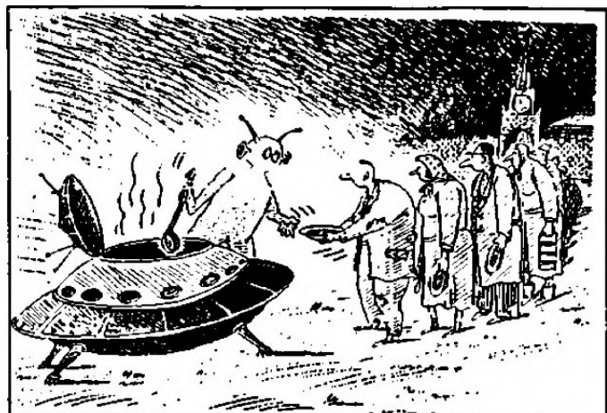
Aleksandr Umyarev Moscow