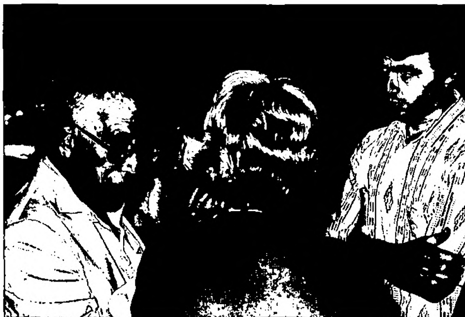
Arch-skeptic Philip Klass entertains the faithful.

and the universe as a whole. In other words, there are a lot of similar situations out there thought to be conducive to life: at the same time, there are certain underlying principles of evolution which dictate that any said life will closely resemble our own in rough physical terms. Who or whatever ET is, he, she or it isn't likely to have, say, five limbs and three eyes or two heads. So close encounter eyewitnesses who report humanoid creatures shouldn't be discounted out of hand.