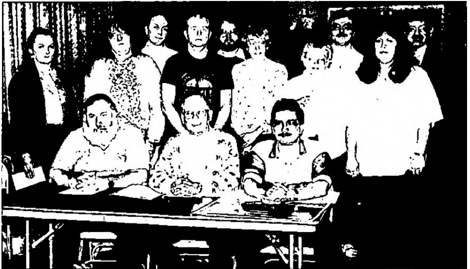
Some of the attendees at a New York State Meeting held in Auburn, NY on November 3, 1990.