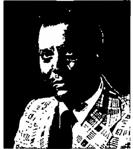
Raymond E. Fowler

Here is a provocative work that dares to respond to the ultimate question for any follower of UFO and extraterrestrial phenomena: Why are they here? Based on amazing new discoveries, The Watchers presents an answer that will shock and startle you.