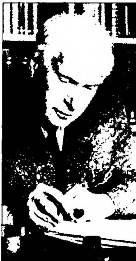
C. J. JUNG

Unfortunately, Jung's purely speculative sallies into alternative interpretations have led to considerable misunderstanding — a very active misunderstanding that was prepared to latch onto anything to feed itself. This misconception has resulted in some ufologists claiming that Jung supported this, that, or the other theory, simply because he mentioned it and made a few cogent comments.