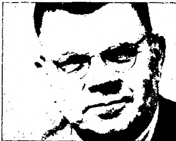
EDWARD U. CONDON

His admission that he had reached a negative conclusion before the study was really underway belied his