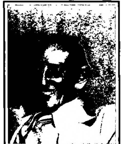
DONALD E. KEYHOE 1897 - 1988

Director so they may be formally nominated. State Directors may nominate themselves. This is an opportunity for a dedicated person to help influence the goals and objectives of MUFON and the future of Ufology. Please give this matter your prompt and serious consideration since only two nominations have been received by MUFON in Seguin, Texas as of November 21, 1988. We hope to have at least four nominees so there will be a choice of qualified candidates.