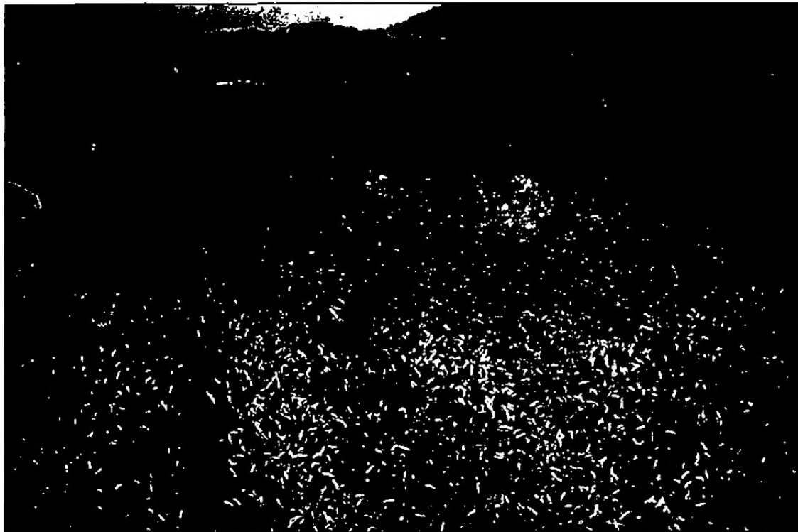
Plate Two: Westbury Circle ©1987 Colin Andrews