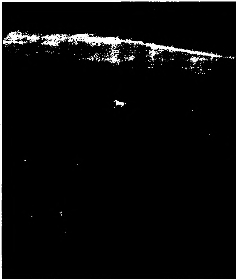
Plate Three: Circle below White Horse © 1987 Colin Andrews.