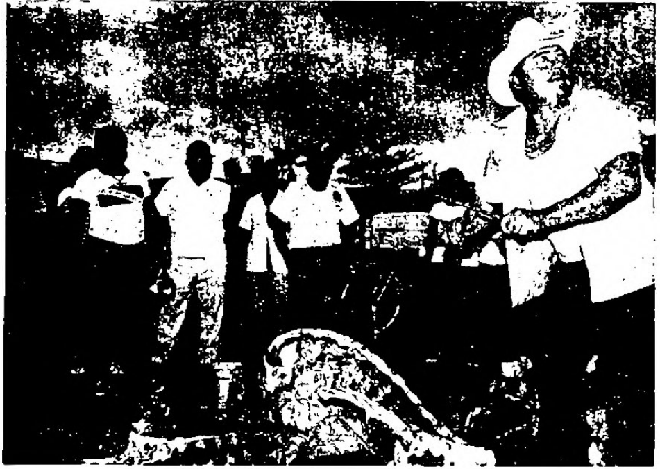
Butchered bull in Isla Mujeres, Mexico