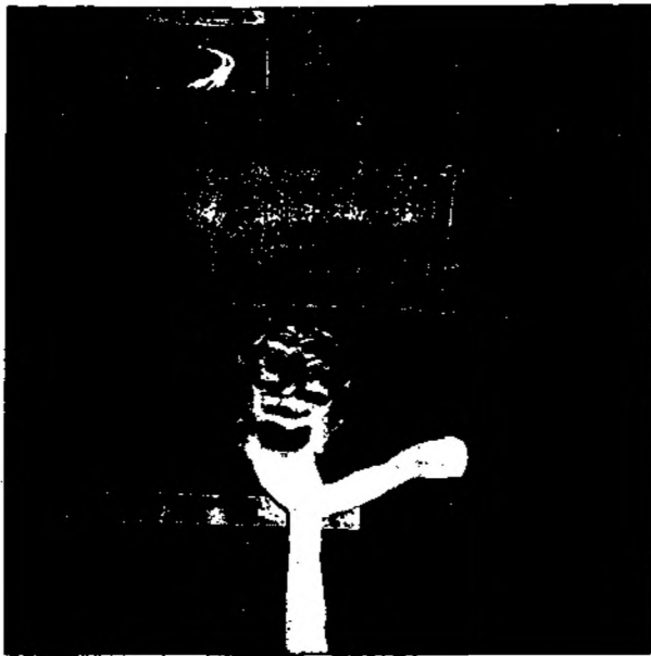
Figure 1. Thomas Photograph