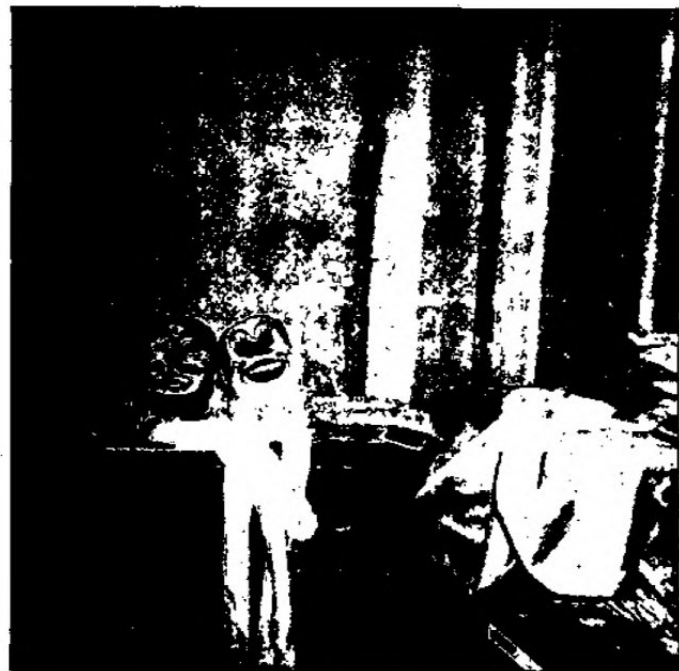
Figure 2. Bailey Photograph

Reverend Bailey alleges that one of the "entities" jumped from the table and fled to the bathroom door, as did the other moments later. Several of the photographs which Bailey took (after he apparently ran out of flashlamps) are alleged by Ann to show humanoids, for example, standing in the bathroom doorway. What particularly disturbs me at this point is, that after examining both the original photos and slides of those photos, I can assure the reader that.... there are no humanoids! What is