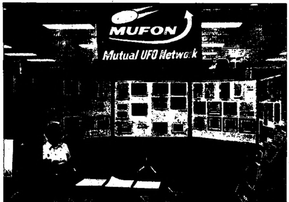
MUFON UFO EXHIBIT Guadalupe County Fair