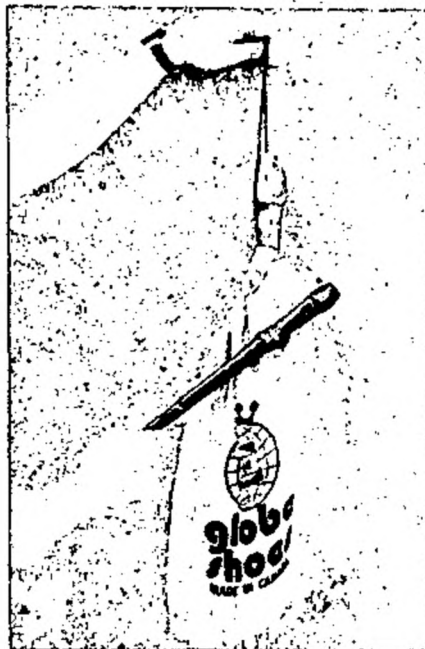
The Recorder Bag

"And there was the smallest one that I took out and showed him that one and I played a little on each one for him to show him the difference. He seemed very interested and then I started thinking about the little one — that maybe I should give it to him as a gift. So I asked him. I took the bag back off him; I had the little one in my hand and asked him if he'd like to take it back with him as a souvenir. He said: 'That would be