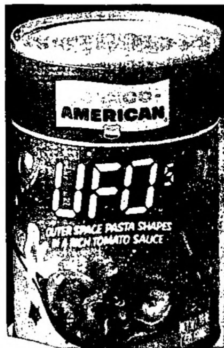
UFOs as "Pop Culture"

Letters to the Editor are invited, commenting on any articles or other material published in the Journal. Please confine them to about 400 words. Articles of about 500-700 words will be considered for publication as "Comments" or "Notes." All submissions are subject to editing for length and style. Please type and double-space all articles.