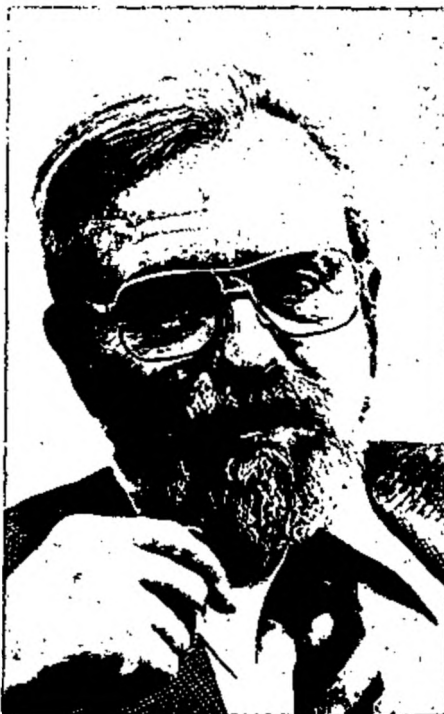
J. Allen Hynek, PhD, Scientific Director of CUFOS