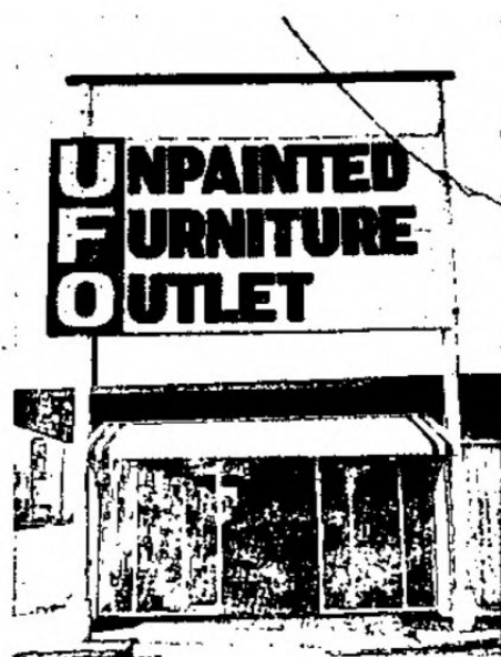
Store sign in Seguin, Texas

In North America, he believes only the Olympic Peninsula in northwestern Washington is lush enough to hide Bigfoot in the number that would be