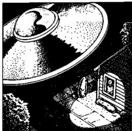
The Case of the UFOs