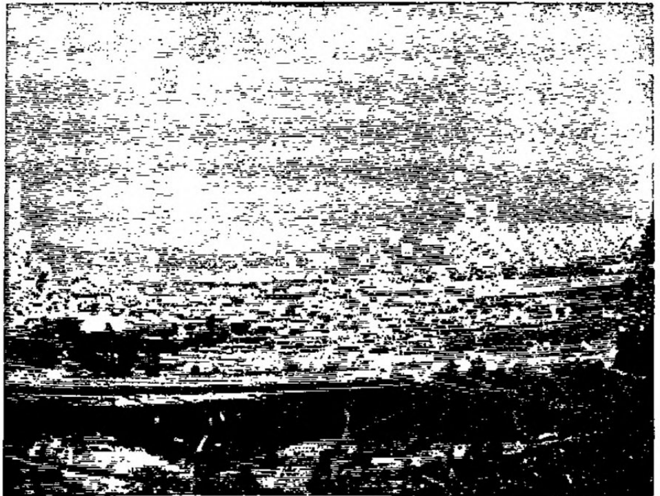
Videotape picture of UFO-like object, faintly visible here as elongated object in center above skyline

Later on that afternoon while I was reviewing the material on the tape I saw a flash go by and I took another look at the frames going by one at a time. I noticed what looked like a cloud going by on four frames. The more I looked at this cloud it seemed to have a form to it with somewhat of a long trail almost. I called Channel 11 up at first but they weren't able to send a reporter out that day. I called the UFO Reporting Center in Seattle and they said that they would contact me on Monday. Then on Monday I went over to Channel 11 to have them check over the tape I had to see what they thought it was. One thing that was a little odd: their viewer showed an electrical disturbance everytime the object came on