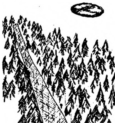
August 11, 1982 Maple Valley, Wash.