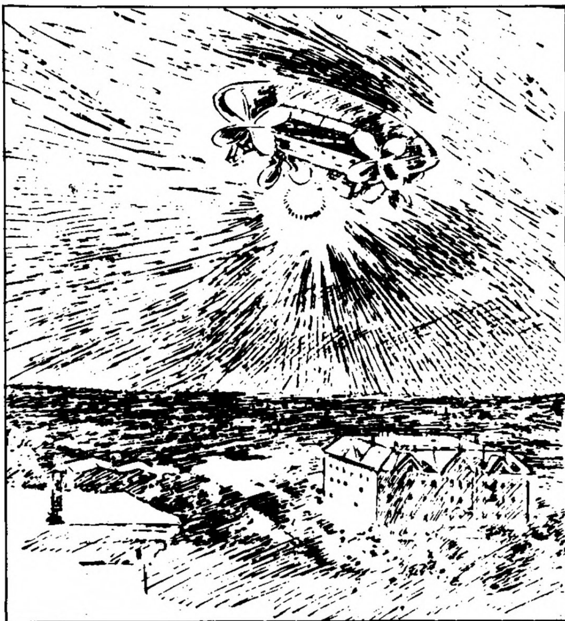
LATE 1896 ENGRAVING FROM SAN FRANCISCO CALL