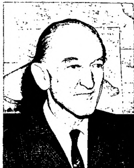
MAJOR KEYHOE JOINS MUFON BOARD