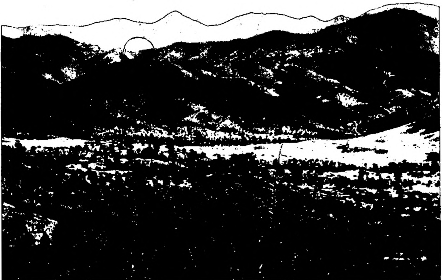
Tehachapi Mountains UFO (circle). See California Report, Page 16.