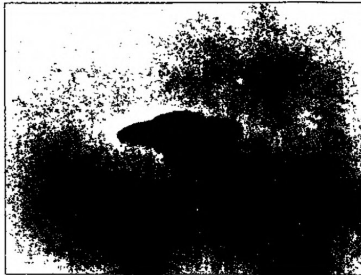
Alleged Pleiadean spacecraft

There is photographic evidence to suggest usage of the double print technique. The double print technique