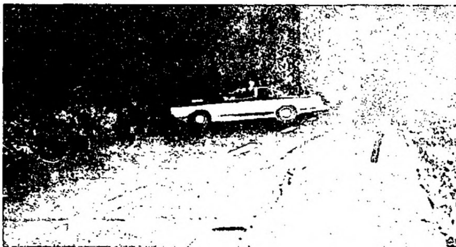
Deputy Sheriff's car after skidding to a halt

We tried unsuccessfully to obtain hardness readings in the exact bend area with the microhardness tester. The error in performing that test on a curved, rough surface was too great to conclude anything. An exact test would require cutting and polishing a specimen.