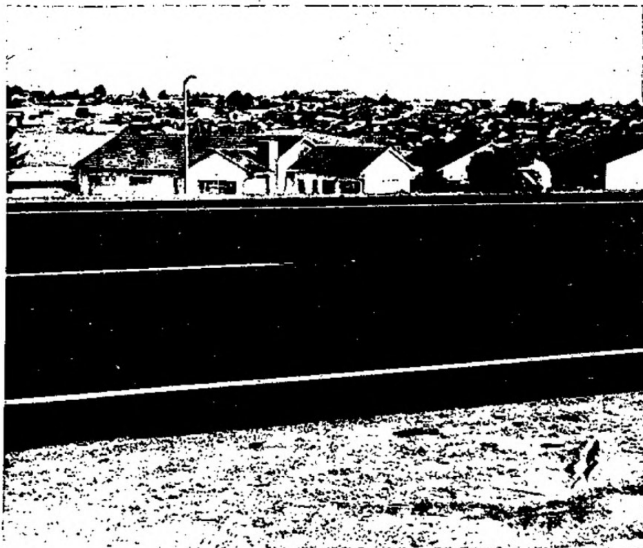
Top road showing width of object, Andre in background.

"We just stood there for a moment or two, quite flabbergasted." Then they walked quickly down the hill to