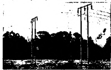
Electric power lines within few meters of landing site.

As I stood on the spot where the craft had been, I called to Cheeky and he came to me readily, so he showed no fear of the area, and there was obviously no scent which he could be afraid of. However, it is important to