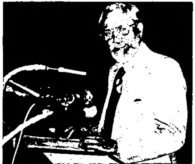
Dr. J. Allen Hynek