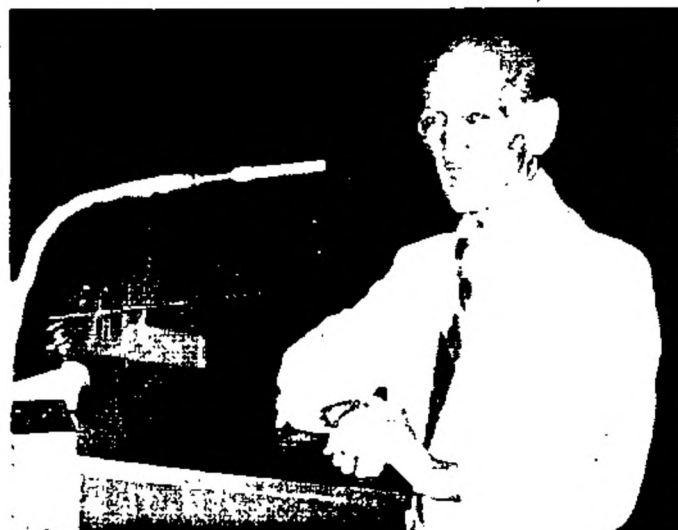
Major Donald E. Keyhoe