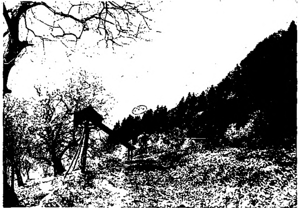
UFO is reconstructed over actual photograph of the area.

Not long time ago UFO-NLP Sekcija ZVEZA SOLT Studentsko naselje blok VII 61000 Ljubljana, Slovenija, Yugoslavia, which is the oldest and most known UFO organization in Yugoslavia, sent a letter describing a UFO spotting. Two of our members went to the field investigation, and in order to obtain the most faithful picture of the event. We arrived to a little idyllic village, near Senozeti. It is situated some 18 kilometers (ten miles) from Ljubljana, its altitude being relatively high, about 700 meters above sea level. The village offers a beautiful view on the surrounding hills. We soon came into contact with the two main eyewitnesses, Metoda G, 18 years old. (We have their address in our files) She sent us the above-mentioned letter, and her mother Helena G.