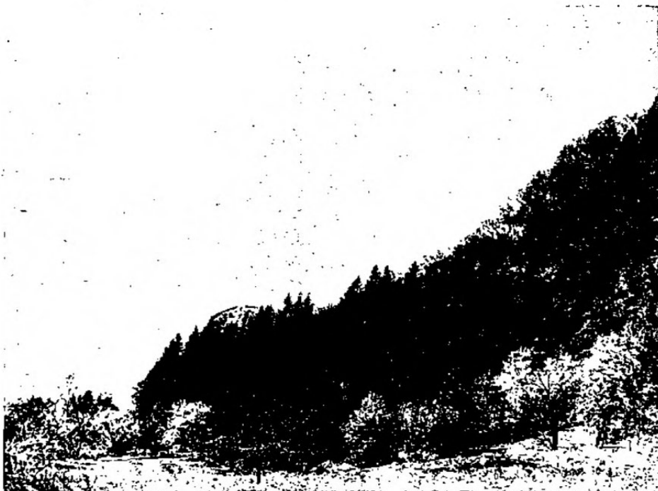
Another reconstructed photograph of UFO and actual area in which it was seen.

far from our house. We listened attentively but there was no sound whatsoever, coming from around us. There was complete silence. Neither did we notice any smoke or something like that coming from the spot. We really did not know what it was all about. People who know us belived us for they know we do not tell lies.