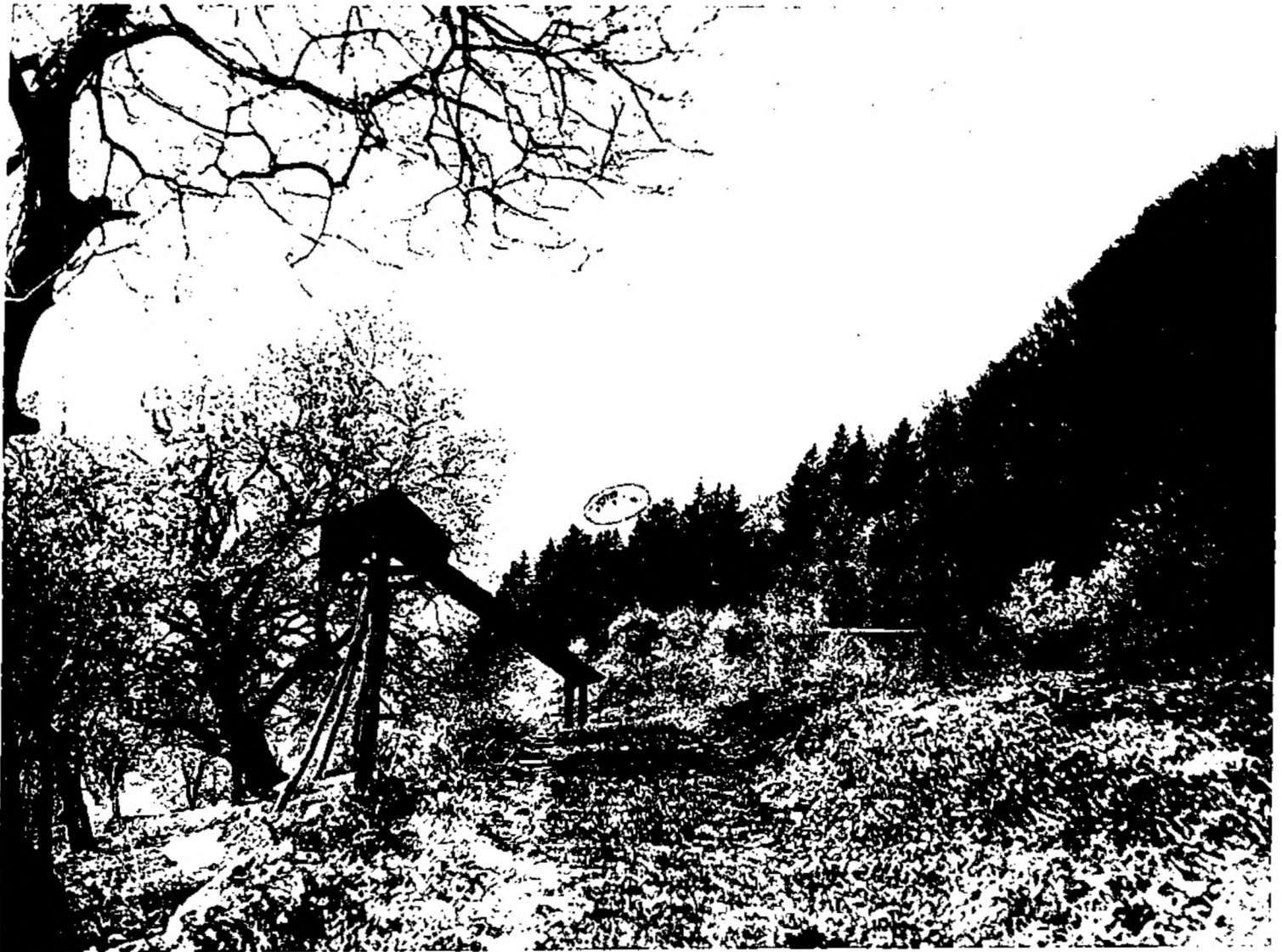
Reconstructed photograph of area near Senozeti, Yugoslavia, where several people witnessed a UFO in February, 1977.

OFFICIAL PUBLICATION OF MUFON MUTUAL UFO NETWORK, INC.